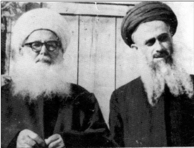
Grandshaykh Abd Allah Ad Daghestani (ق) with his successor, Shaykh Nazim Adil Al Haqqani (ق)